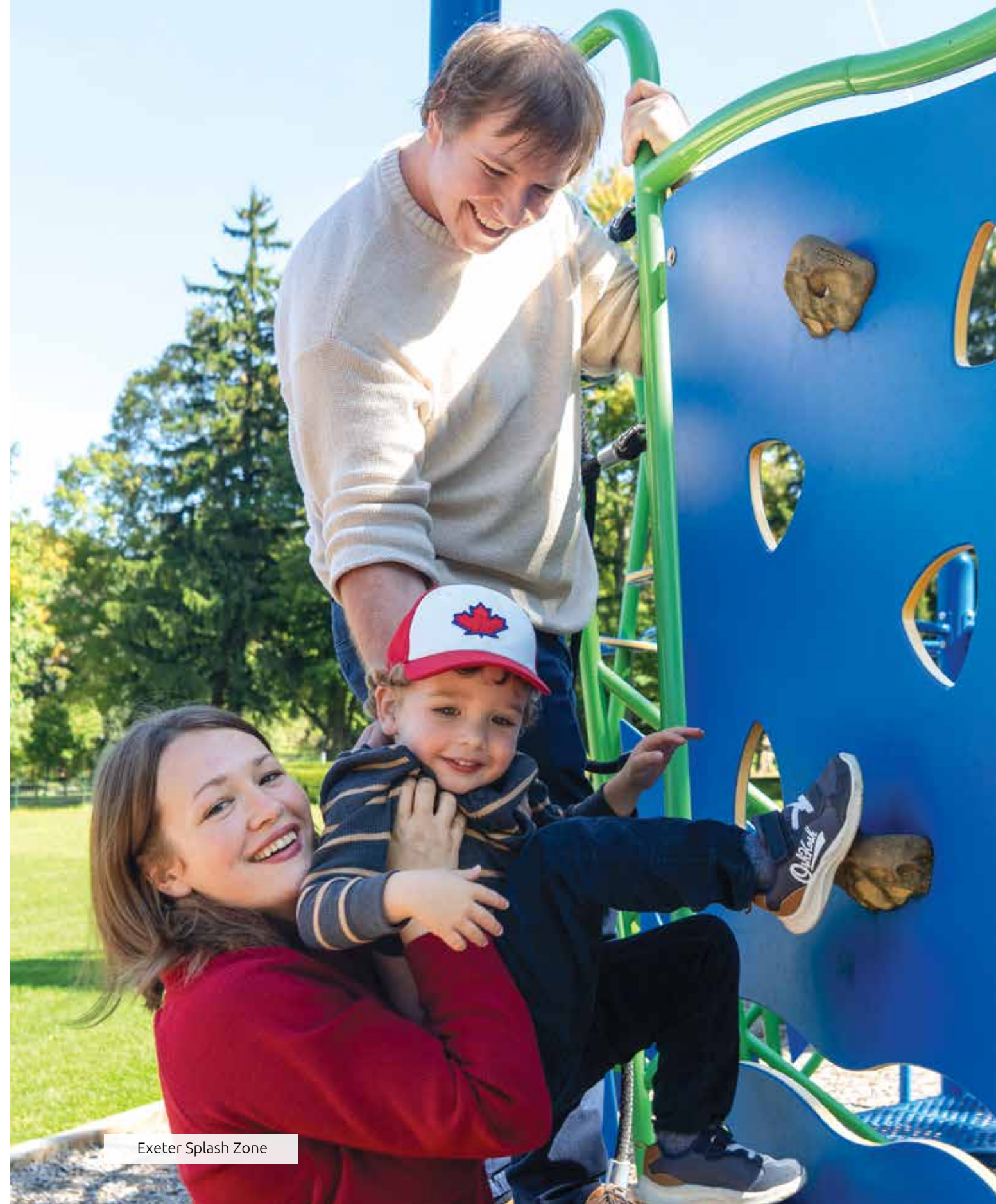
Exeter Splash Zone

Discover the 230-acre natural playground at Falls Reserve Conservation Area , featuring trails, a picturesque waterfall, and a stocked fishing pond. Stop for lunch and a round of mini putt at Sky Ranch Drive-In . Don't miss The Village Toy Castle for a playful experience with a mix of old-school games and summer fun toys. End your visit with a family dinner to remember at the White Carnation Banquet Hall . Their Sunday buffet features a lavish spread showcasing the freshest seasonal produce promising an unparalleled dining experience. Huron County awaits, offering unforgettable moments for the whole family.