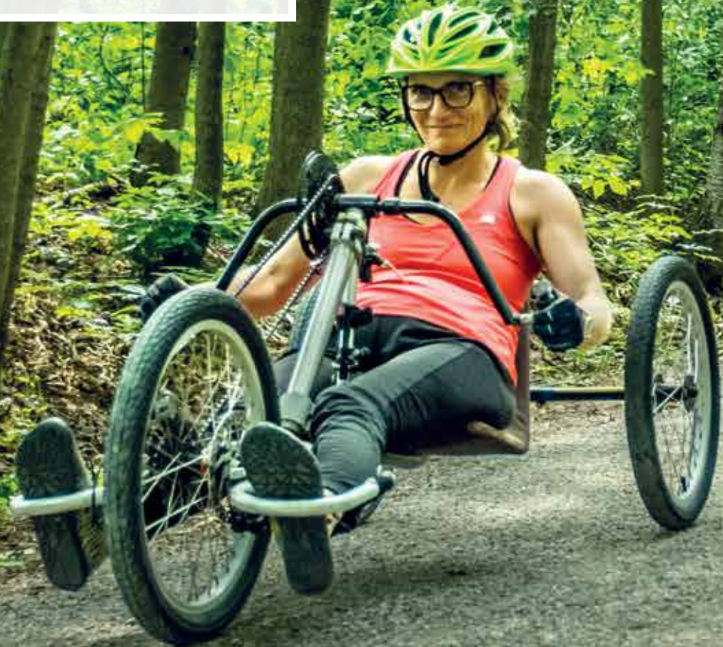
G2G Rail Trail

Discover the stunning landscapes of Ontario's West Coast on two wheels, where every turn of the pedal leads to a new adventure. Huron County's flat terrain and scenic countryside make it perfect for cyclists of all ages and abilities. Ride along peaceful trails, wind through quaint villages, and explore hidden gems nestled in the countryside. As you cycle past thriving farms and orchards, immerse yourself in the region's rich agricultural heritage. Whether you're looking for a relaxing ride or an exhilarating challenge, Huron County offers unforgettable cycling experiences that highlight the natural beauty of Ontario's West Coast.