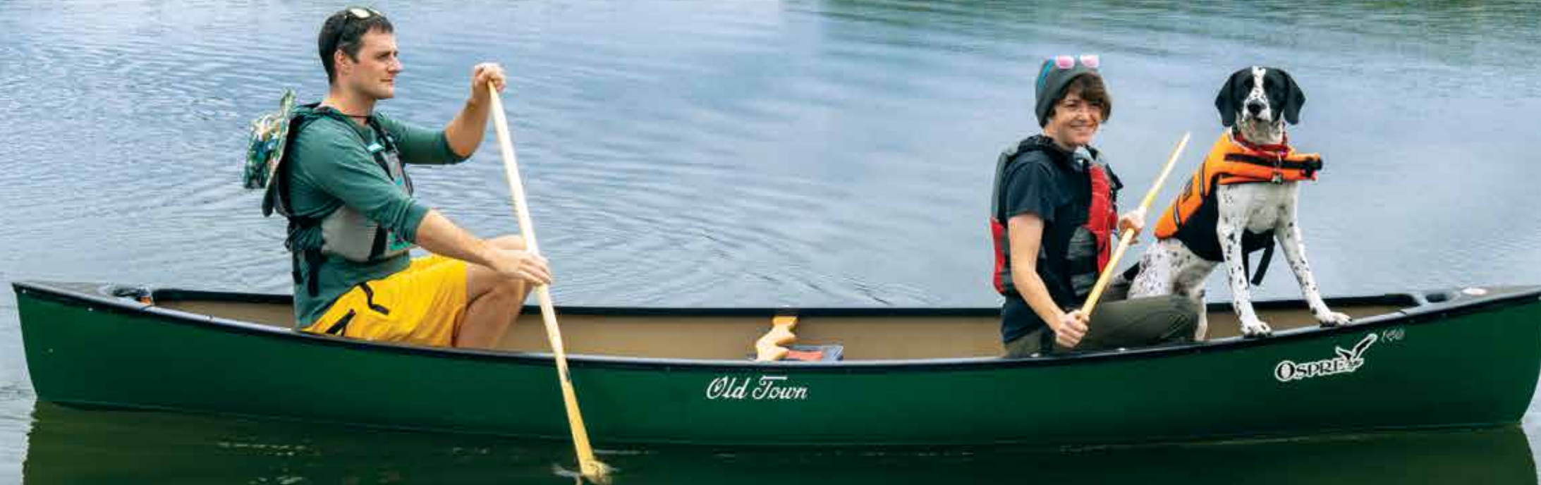
Lake Wawanosh Conservation Area

Huron County is a hub for recreation, boasting a diverse array of activities to suit every interest. Tee off against picturesque backdrops at renowned golf courses, experience the adrenaline rush of Walton Raceway's renowned motocross tracks. Cast your line into pristine waters, paddle rivers and lakes, or climb an indoor bouldering wall. With endless opportunities for adventure, Huron County invites you to discover unforgettable recreation experiences amidst its stunning natural beauty.