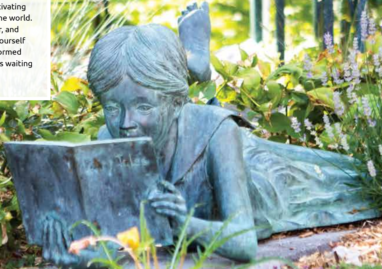
Alice Munro Literary Garden

Immerse yourself in the vibrant arts and culture scene of Huron County! Our theatre companies present a variety of theatrical experiences, from captivating plays to beloved musicals. Artists of all kinds, from painters to photographers, draw inspiration from our picturesque landscapes. Renowned author, Alice Munro, has shared captivating stories inspired by our region with the world. Get ready for drama, music, laughter, and moments that make you think. Let yourself be inspired, entertained, and transformed by the rich arts and cultural offerings waiting for you in Huron County!