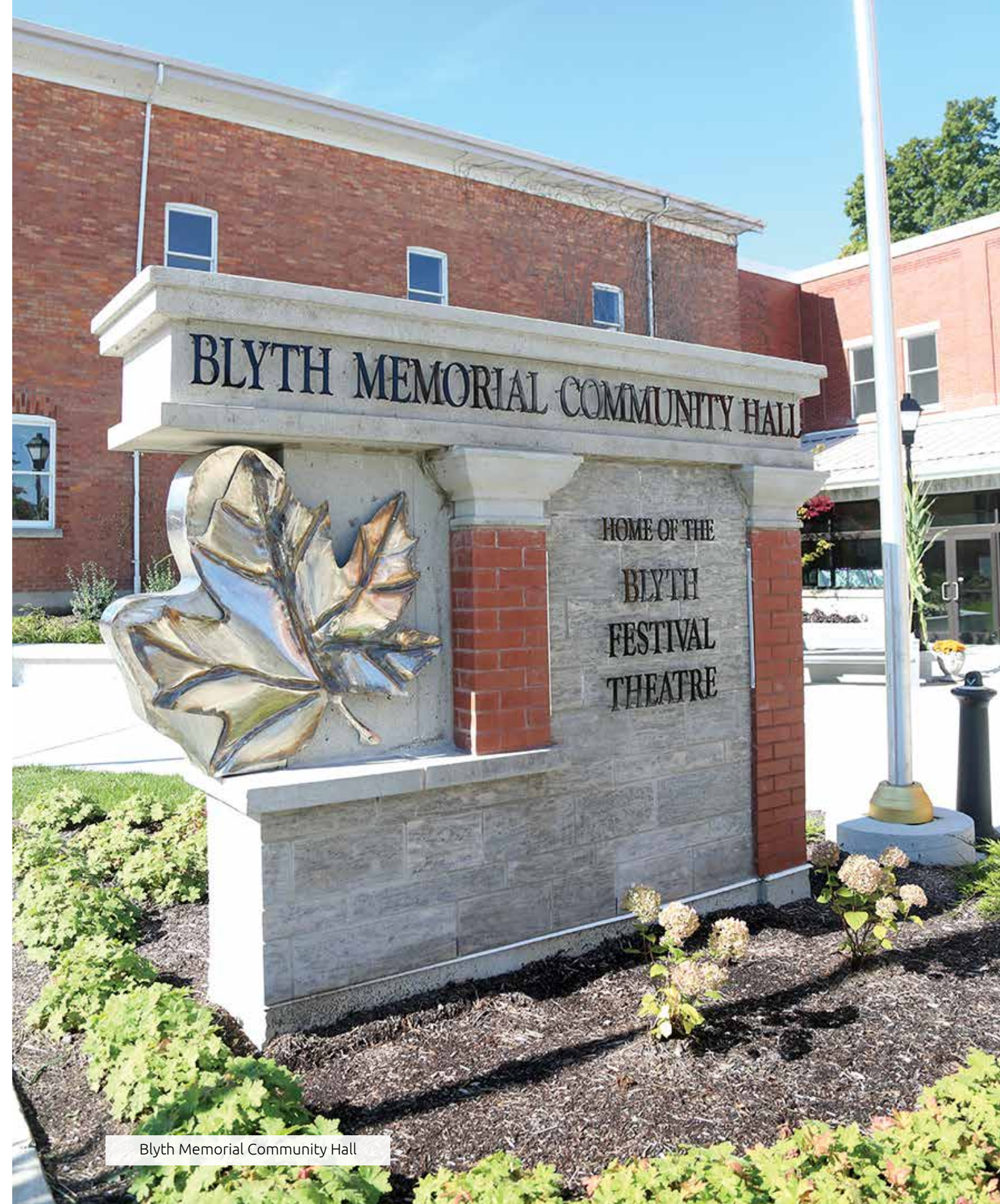
Blyth Memorial Community Hall

On day two, kick off your morning in Clinton admiring the animated murals brought to life with the Artvive app. Then, follow The Arts Trail on Highway 21 , curated by the Bayfield Centre for the Arts , showcasing galleries, studios, and public art. Stop for lunch at White Squirrel Golf Club & Restaurant and enjoy one of their wood-fired pizzas or casual dining menu options. Wrap up your cultural weekend with a matinee at the Huron Country Playhouse , offering a diverse lineup of live theater productions.